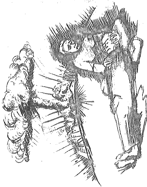
—Hiroshima, August 6, 1945

of our parents, they are our own. We choose our own because we look at the existing society and we do not like it, therefore, we can see no reason to follow the morals and ethics it is based on.